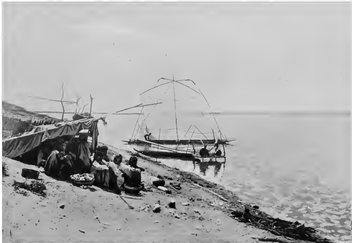
Burmese Fishing Boats on the Irrawaddy